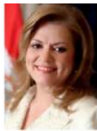
Hon. Mdm. Emilia Alfaro de Franco First Lady, Paraguay (2012-2015) Senator (2015-2018)