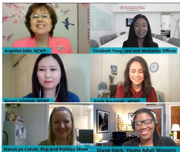
GWPN Forum "The Next Generation"