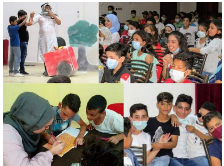
Providing a brighter future to refugee children in Jordan