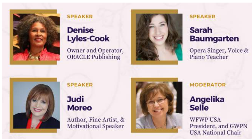
GWPN Forum "Arts and Culture"