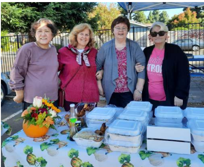
Benefit for Schools of Africa in Northern California

Each year, local chapters and members across the USA organize innovative and engaging events to raise funds for the Schools of Africa Project with ten schools throughout eight African countries. These funds have helped to continually maintain the schools, finance school supplies, improve buildings and classrooms, secure funds for scholarships to low-income students, and much more.