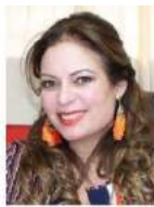
Hon. Mdm. María Fernanda Flores de Alemán First Lady, Nicaragua (1997-2002) Congresswoman (2012-2020)