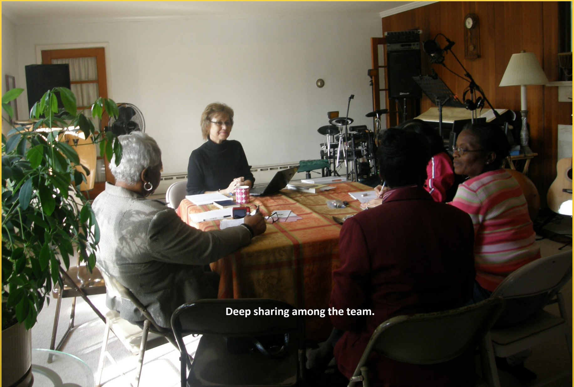
Deep sharing among the team.