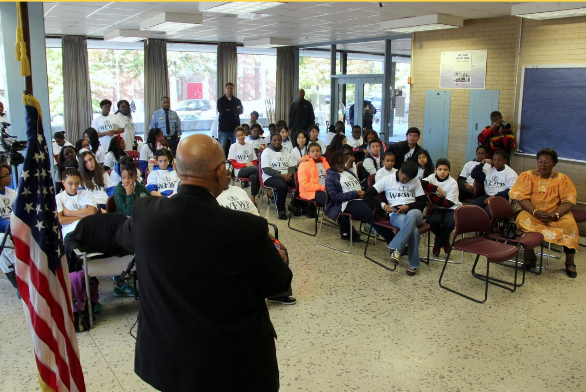
Students and teachers – listening to guidance on leadership.