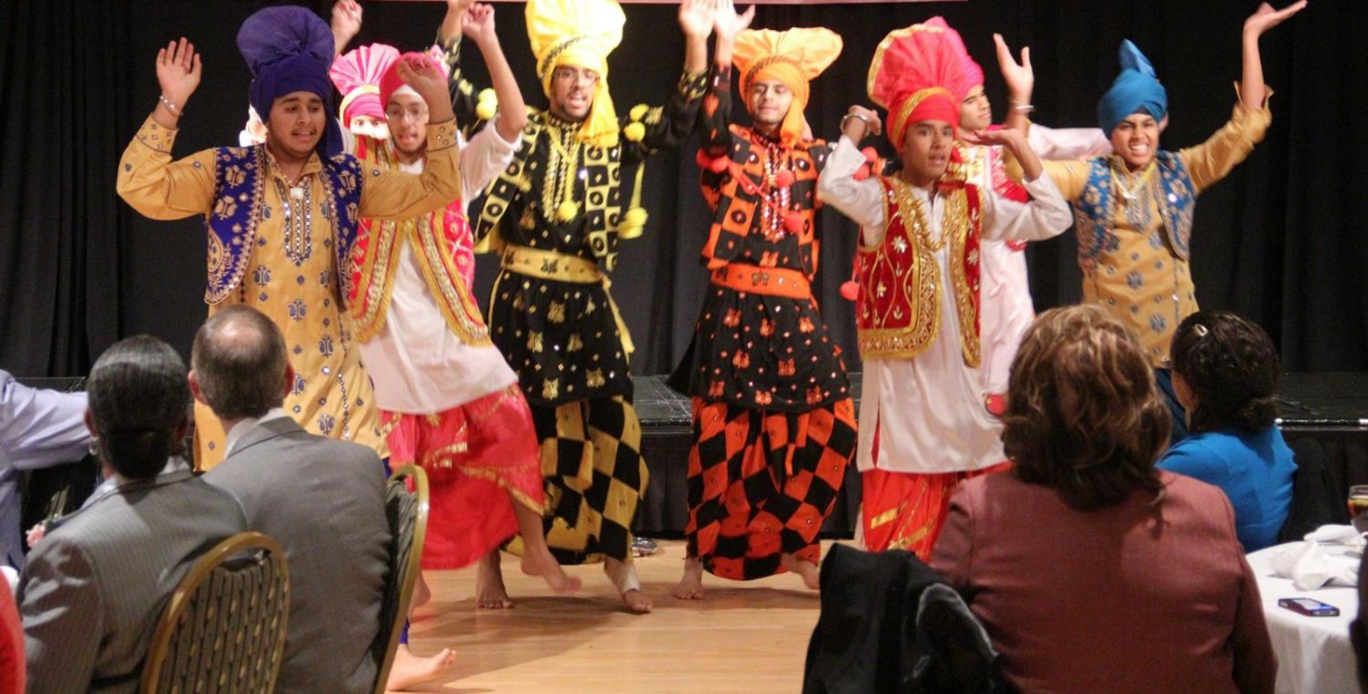
Dance group from Punjab, India, bringing energy of joy and balance to the evening.