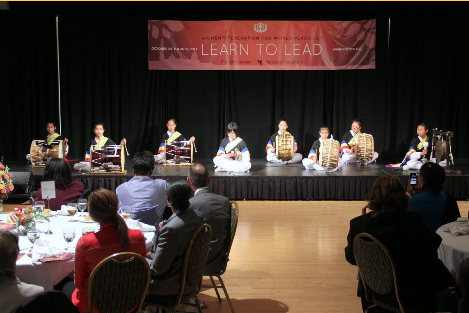
The Heavenly Drummers create a powerful atmosphere after the Bridge of Peace.