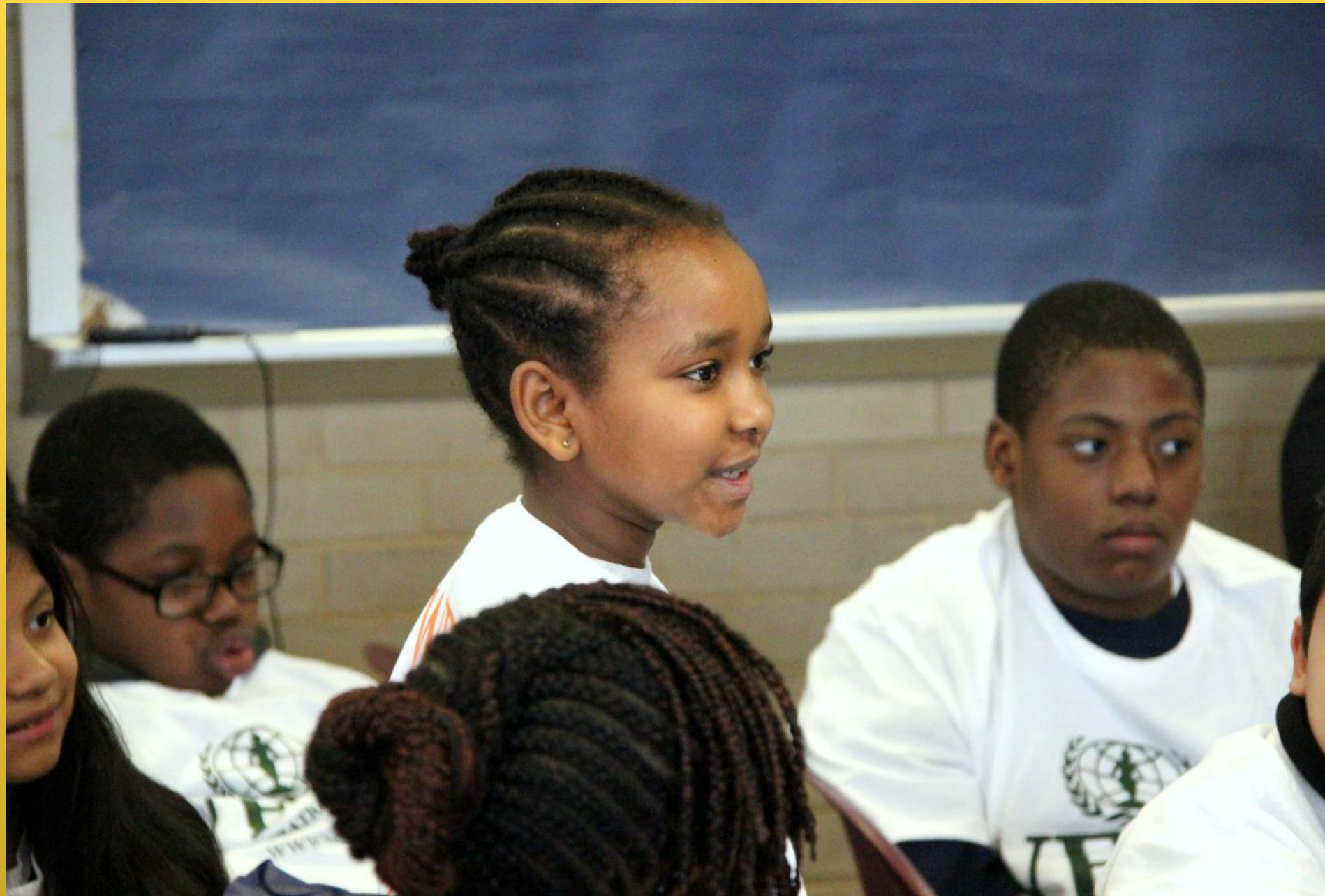
Young student participant asking a question.