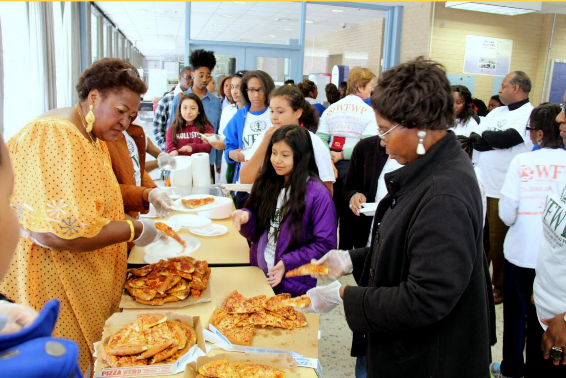
Surrounding store owners donated pizza, drinks and burgers.