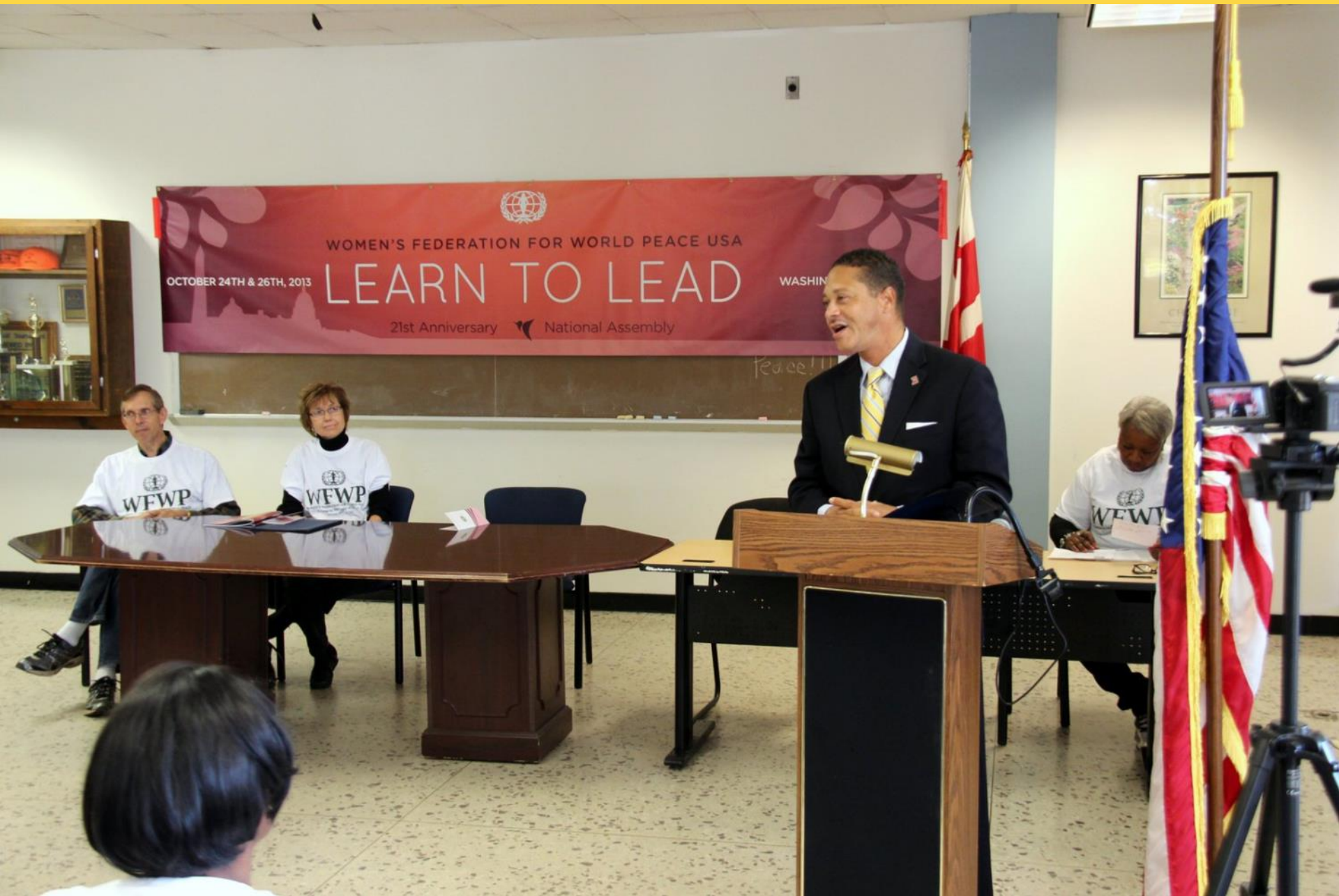
Ken Holman, representative of the Mayor of Washington, DC, addressing group.