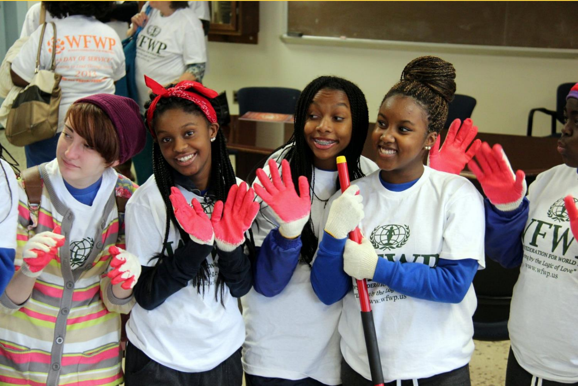
Girls from different schools getting to know each other.