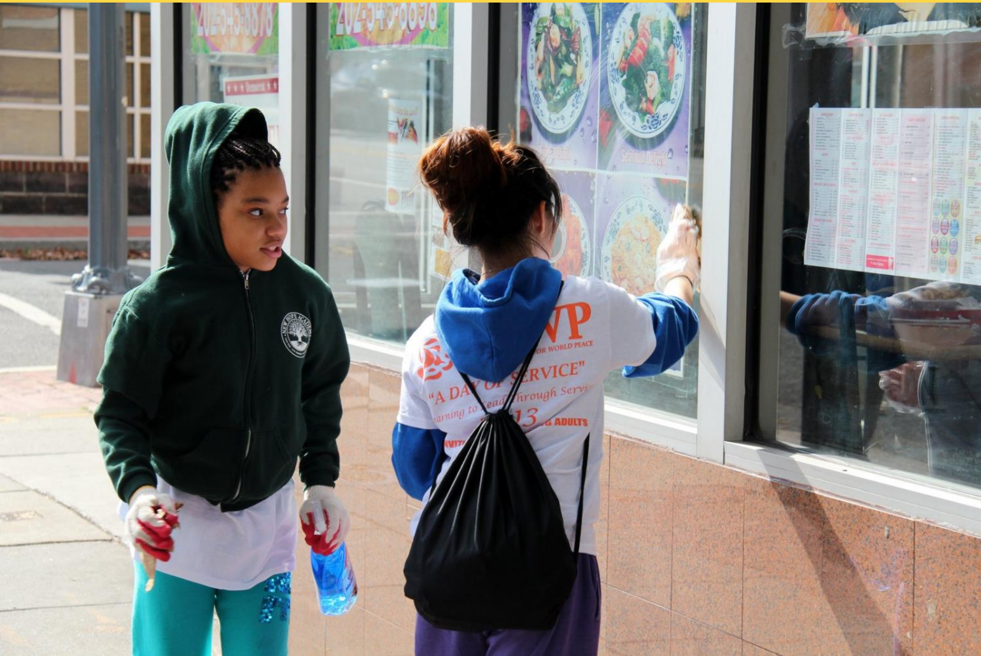
Serving others as a foundation for leadership – future leaders.