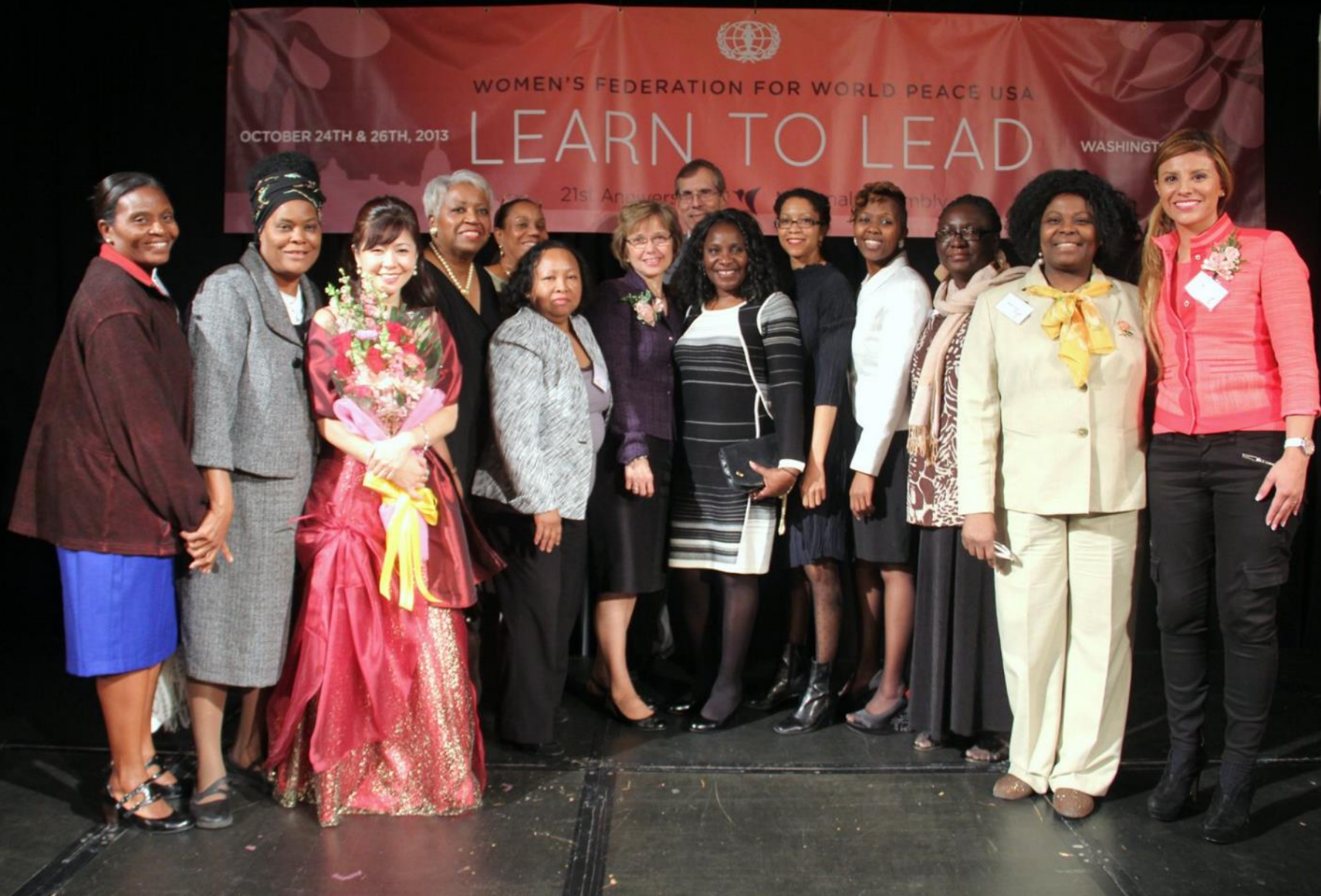
WFWP USA President and Vice President pose with speakers, performers, women leaders.