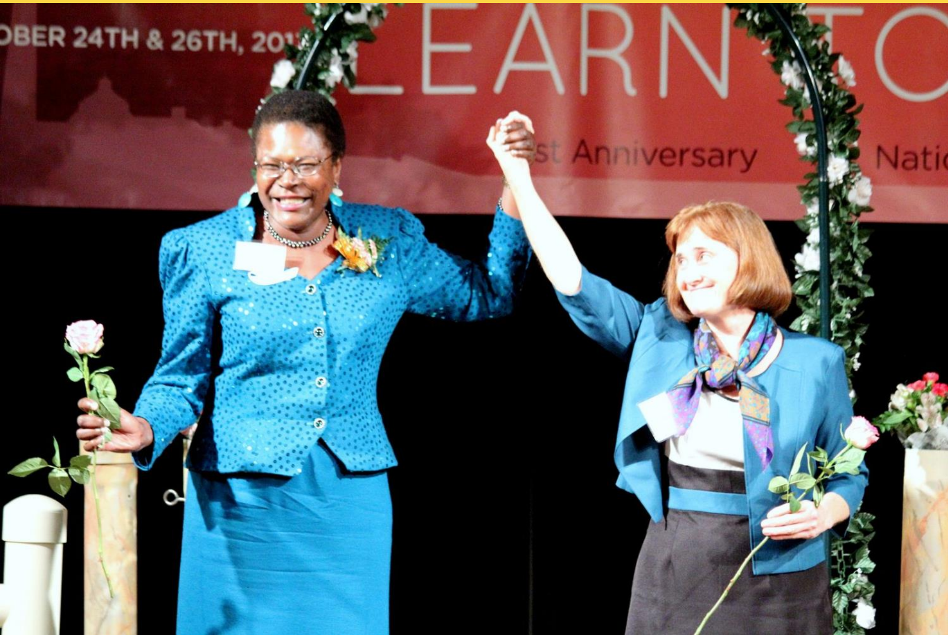
New sisters – new beginnings – healing took place.