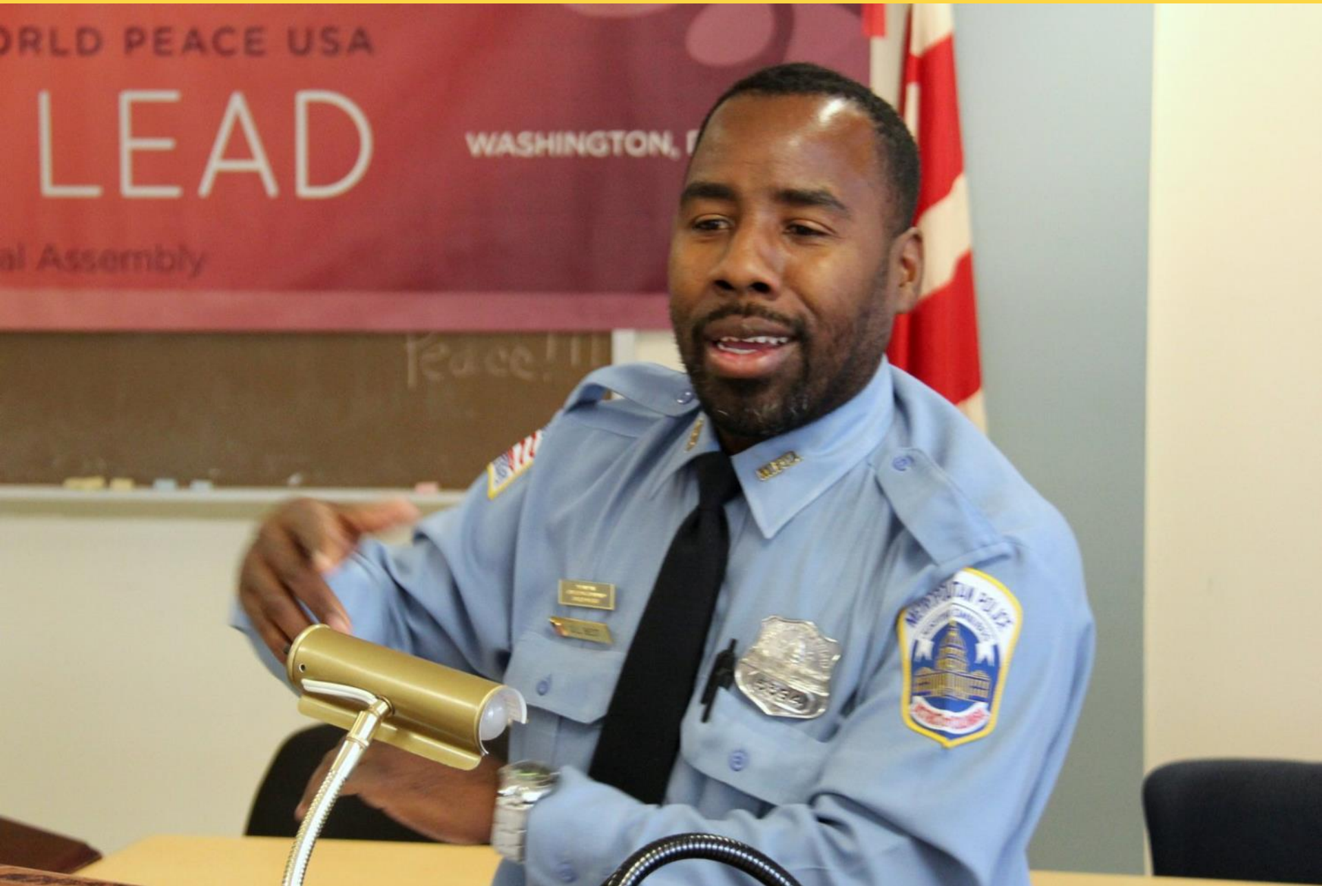
4 th Precinct Police Chief addressing the audience of over 70 people.