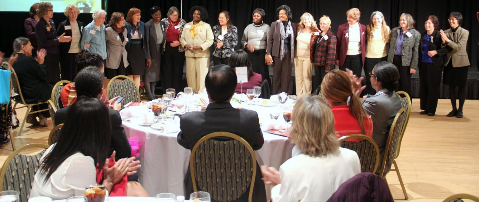
WFWP chairwomen and representatives also receive AFP appointment.