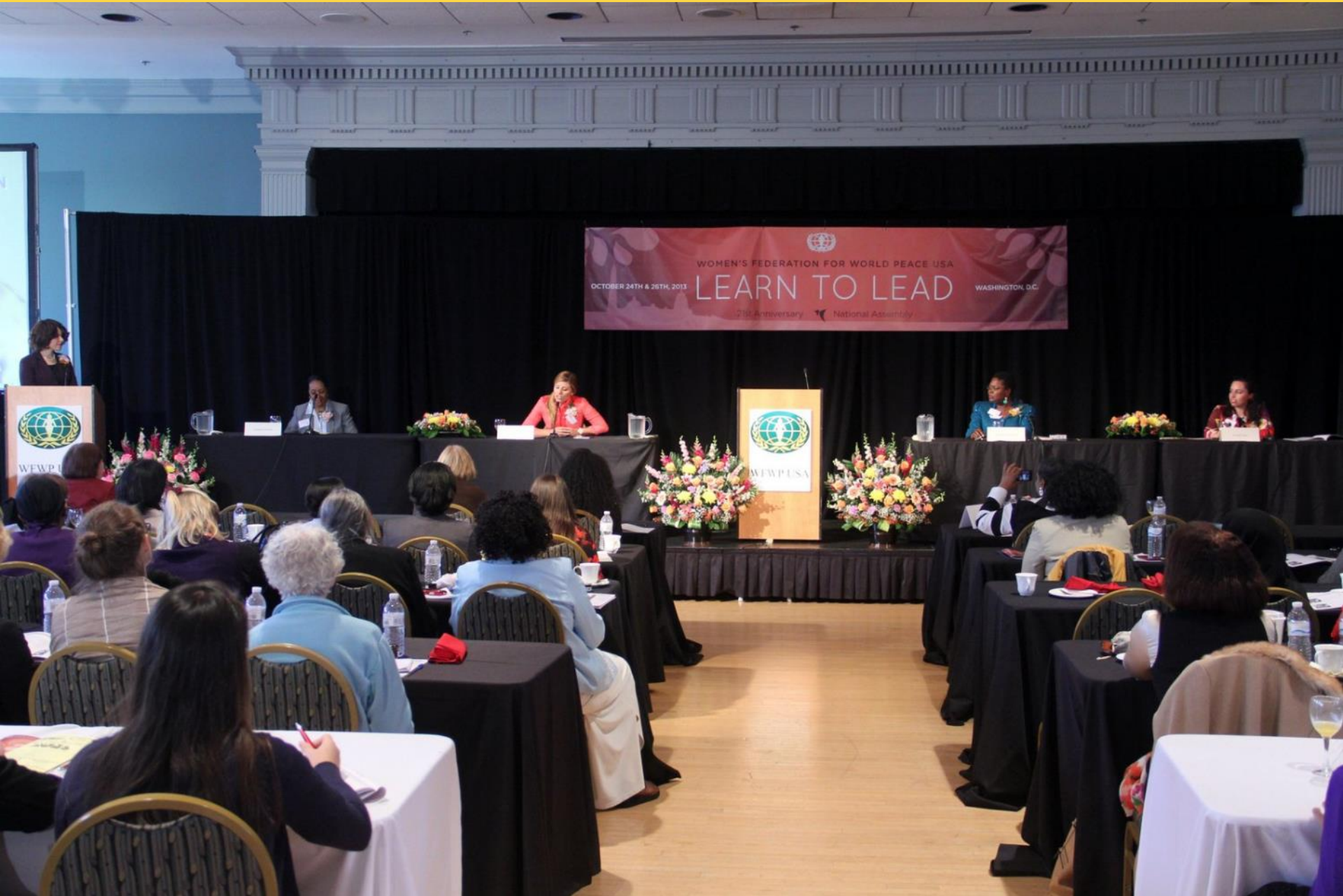
Panelists fielding questions from the audience.