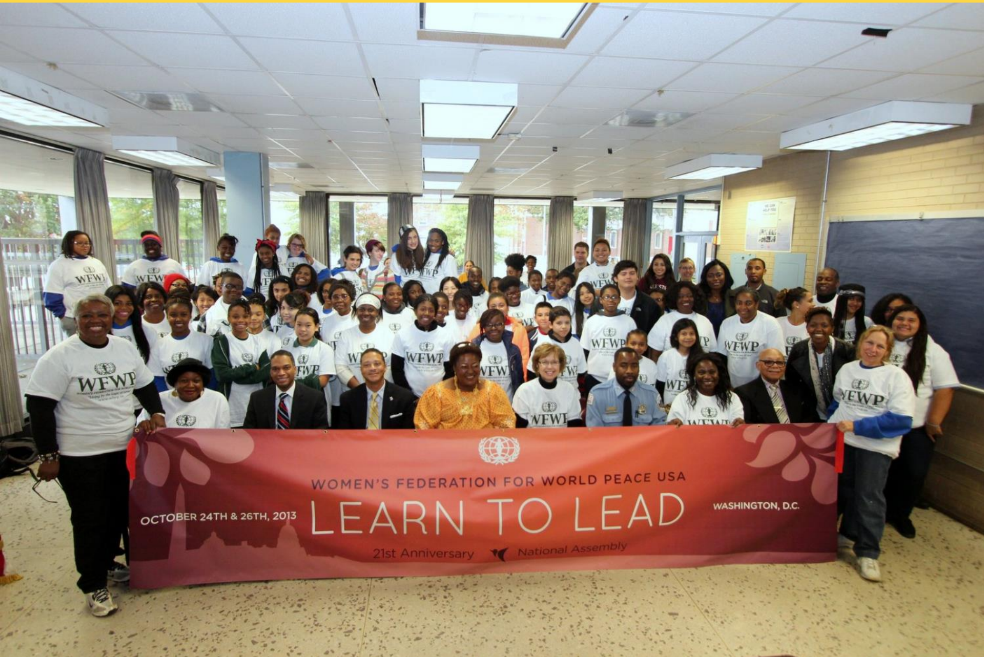
Day of Service, October 24, 2013, Washington, DC.