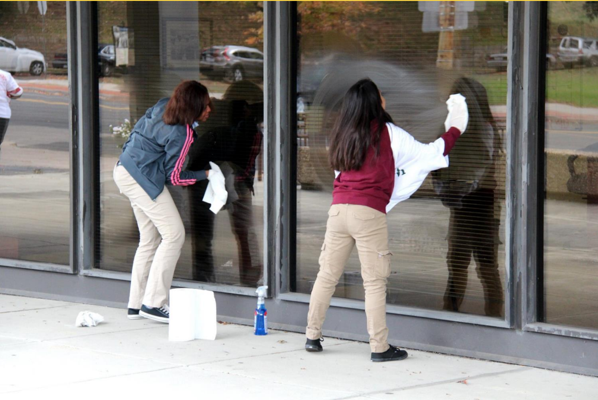
Cleaning windows on Georgia Avenue in Washington, DC.