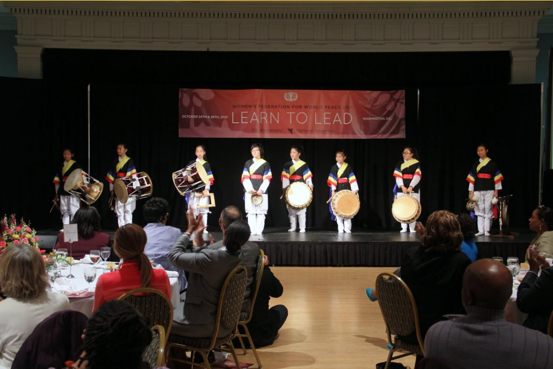
All are proud of the group spanning the ages from 11-20.