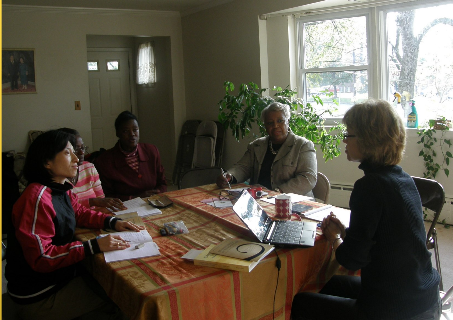
Vision 2020 workshop and leadership training for Haitian sisters at MD CARP center.