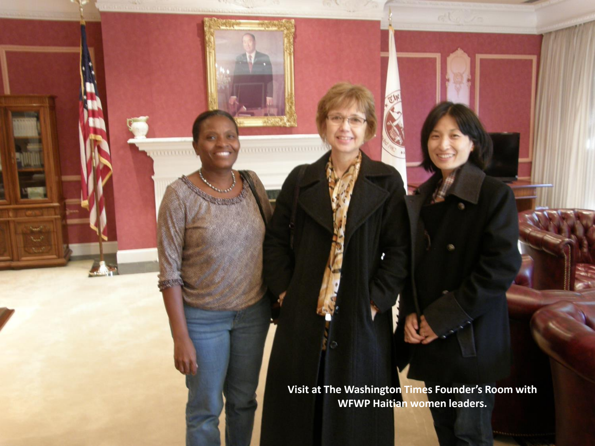
Visit at The Washington Times Founder's Room with WFWP Haitian women leaders.