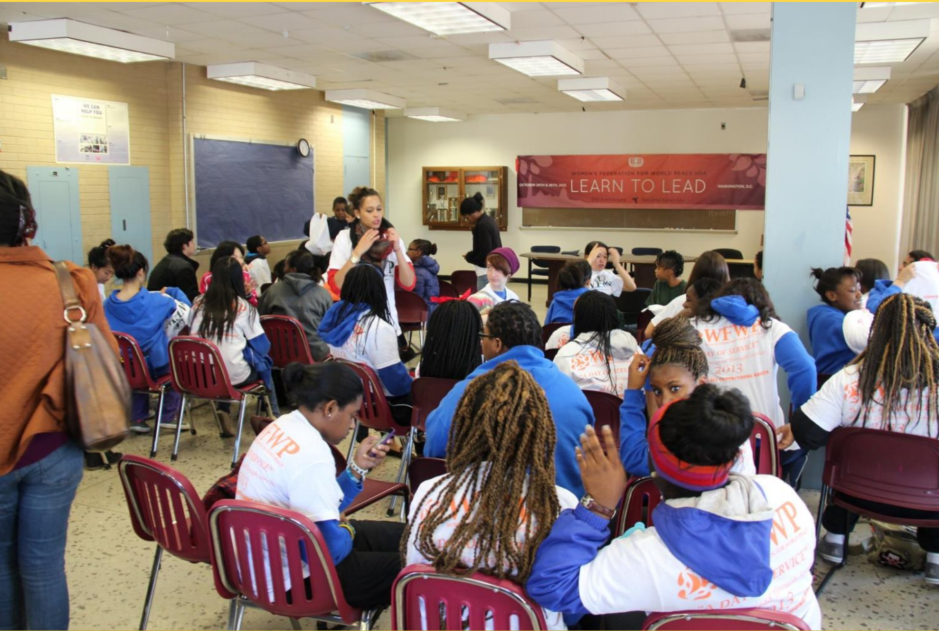
Students gathering at 4 th Precinct Police Station in Washington, DC.