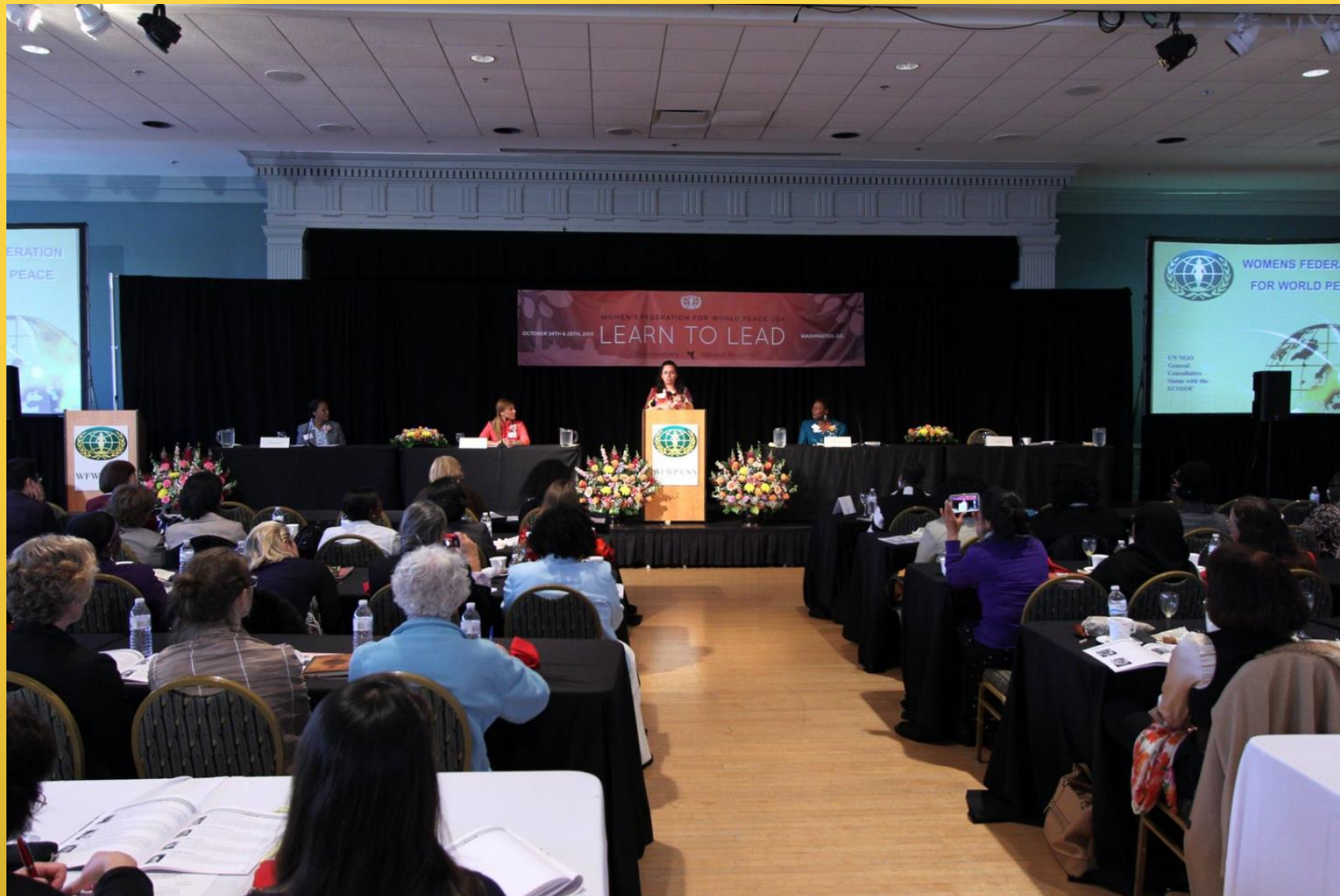
2 nd National Global Women's Peace Network (GWPN) panel discussion.