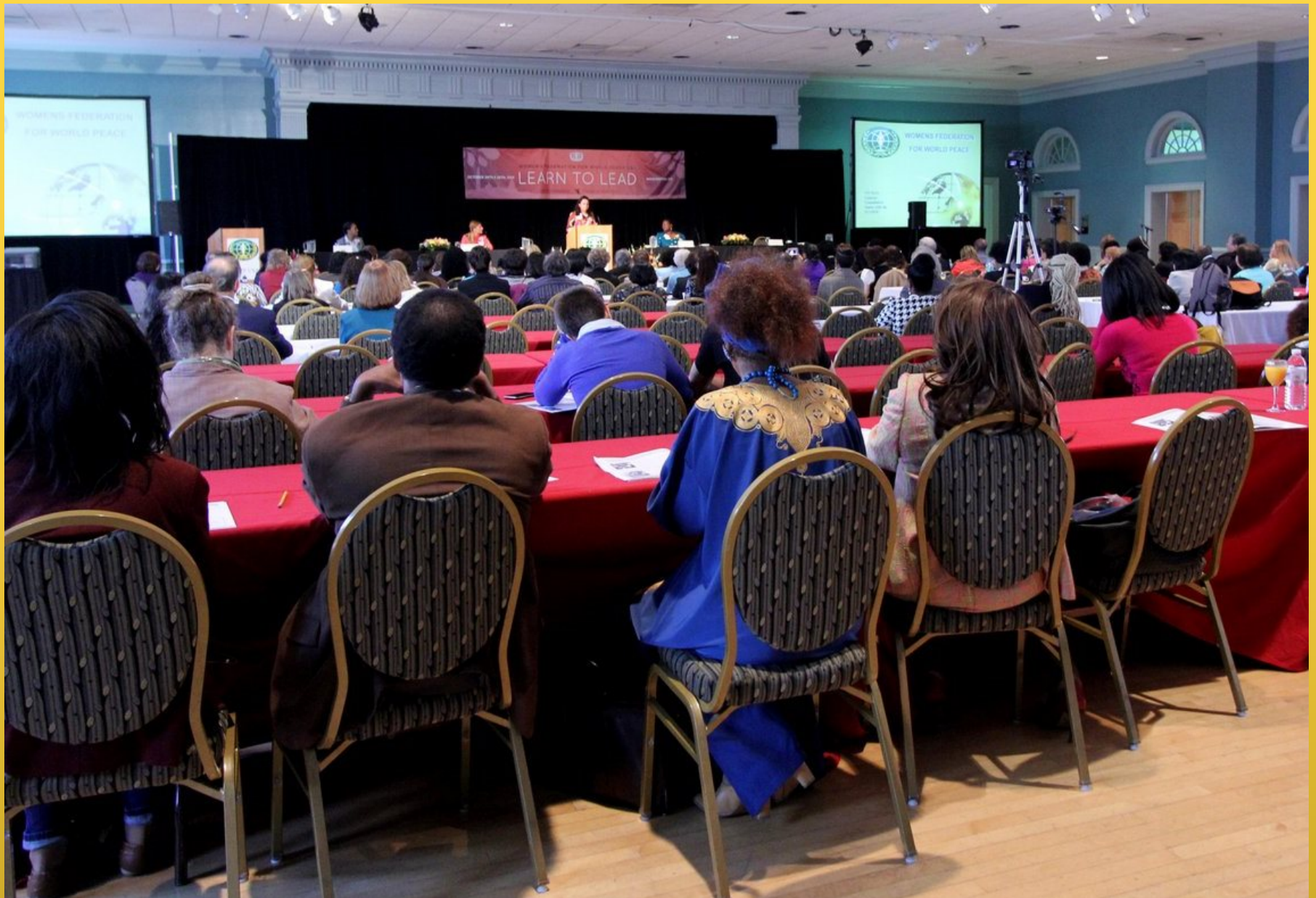
150 participants attended the GWPN panel discussion. Q&A session lasted over one hour.