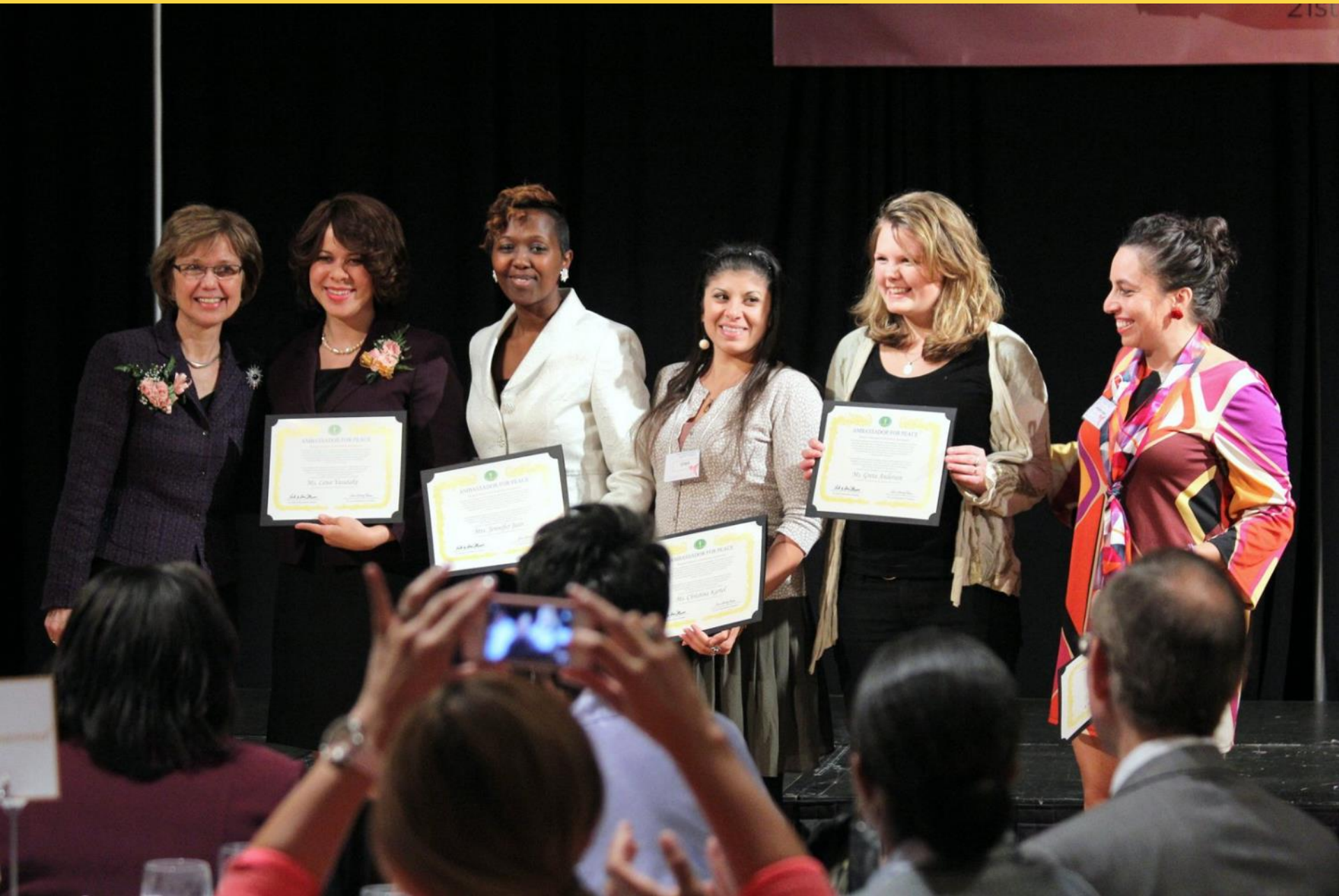
Young women leaders receive the Ambassadors for Peace appointment.