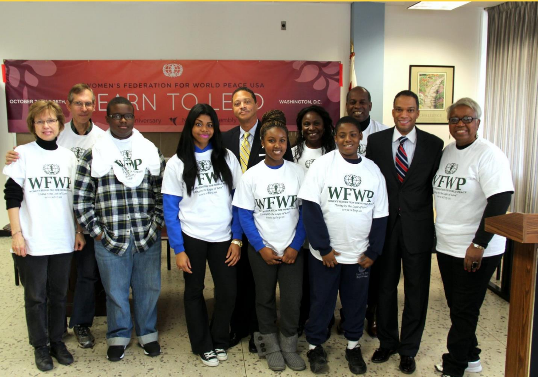
Students representing four schools posing with speakers and government officials.