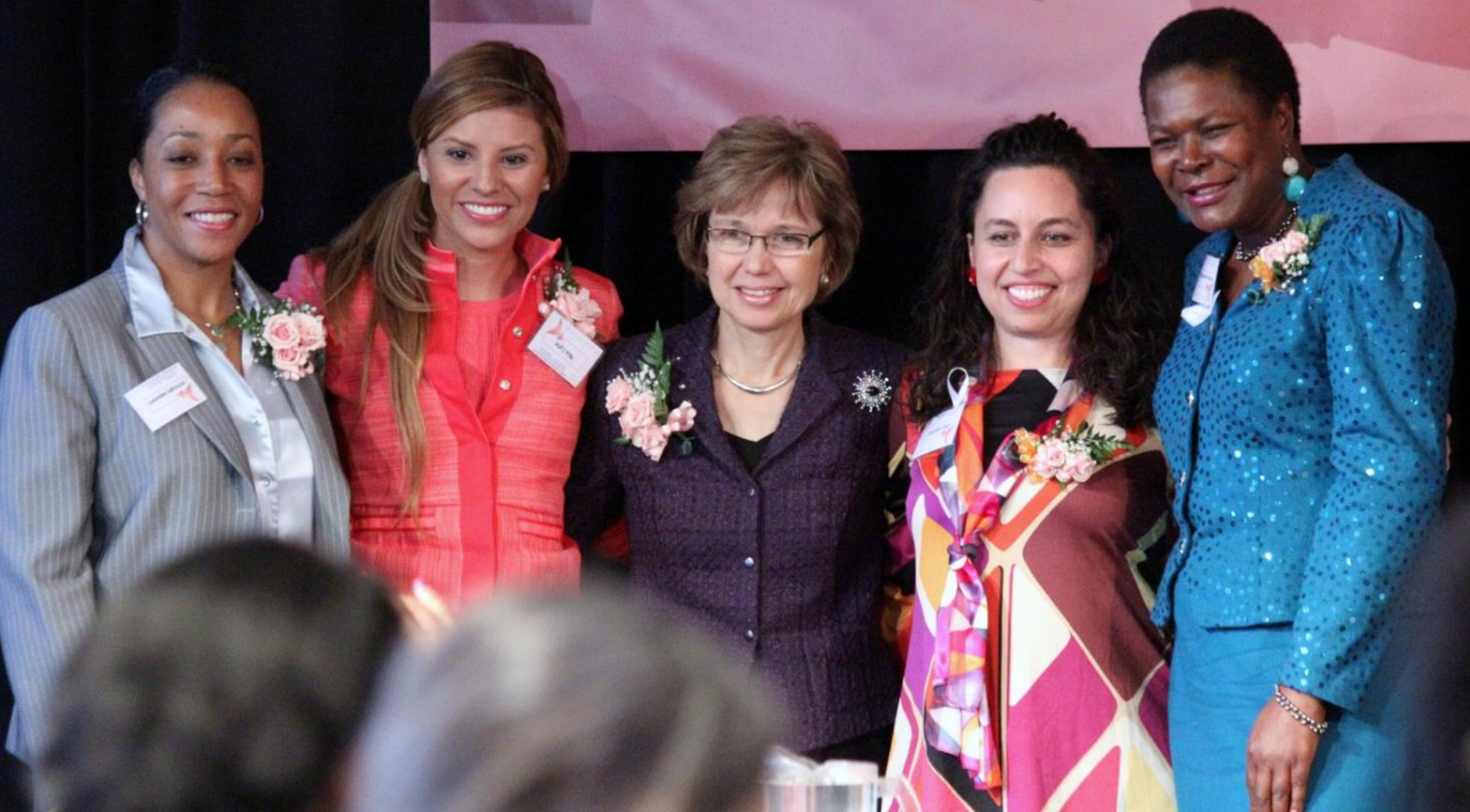
GWPN Panelists posing with WFWP USA president.