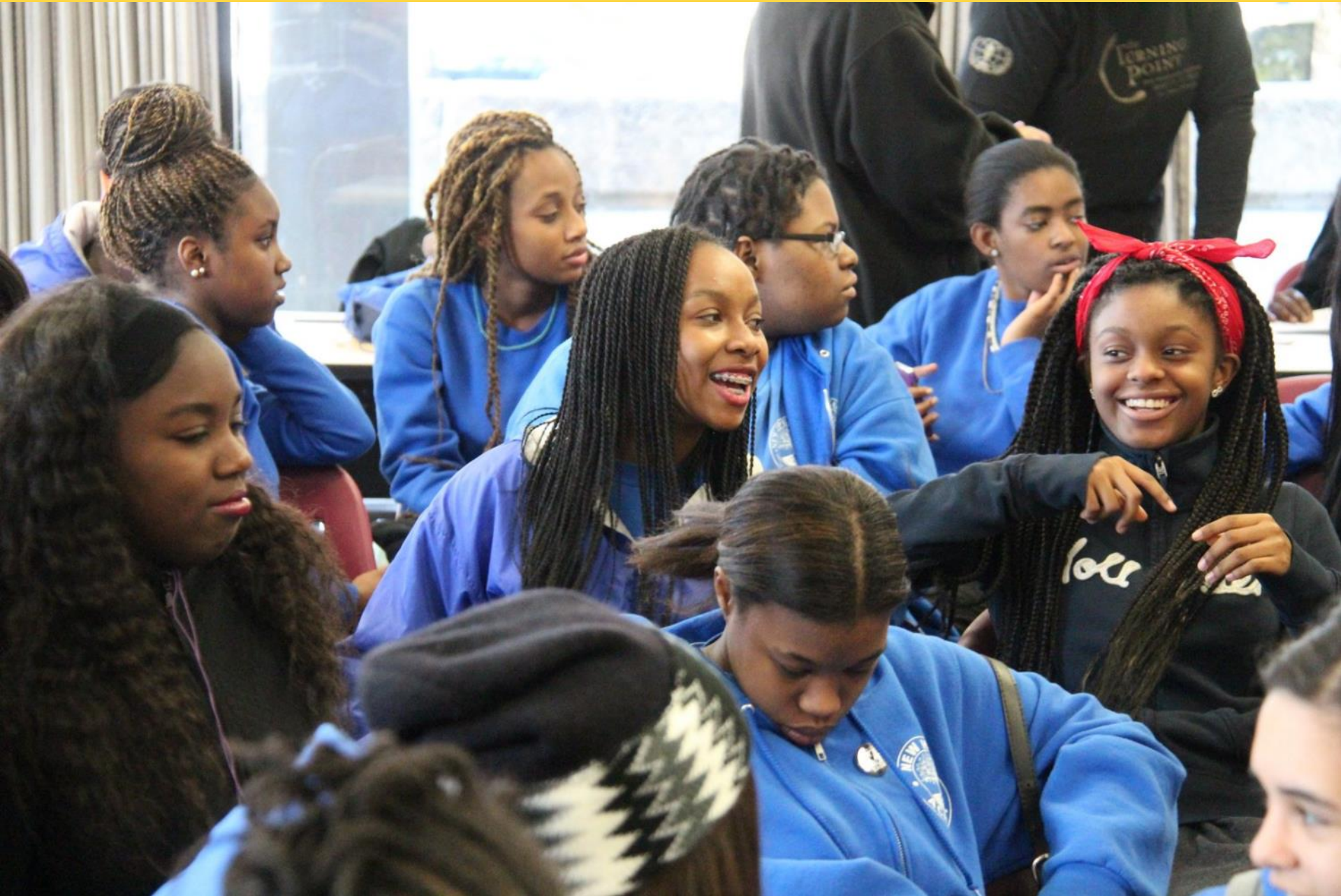
Thirty students joined the Day of Service from New Hope Academy, Landover Hills, MD.