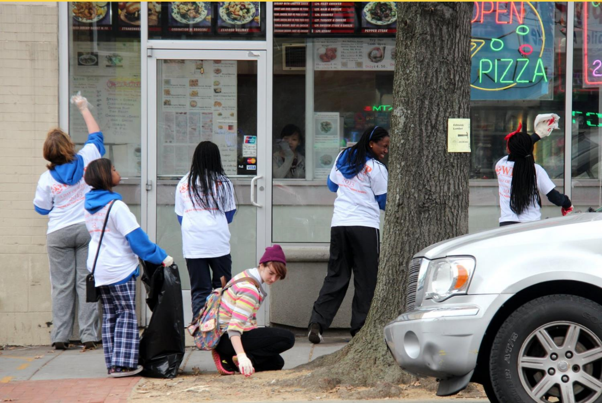
Many store owners are inspired and amazed.