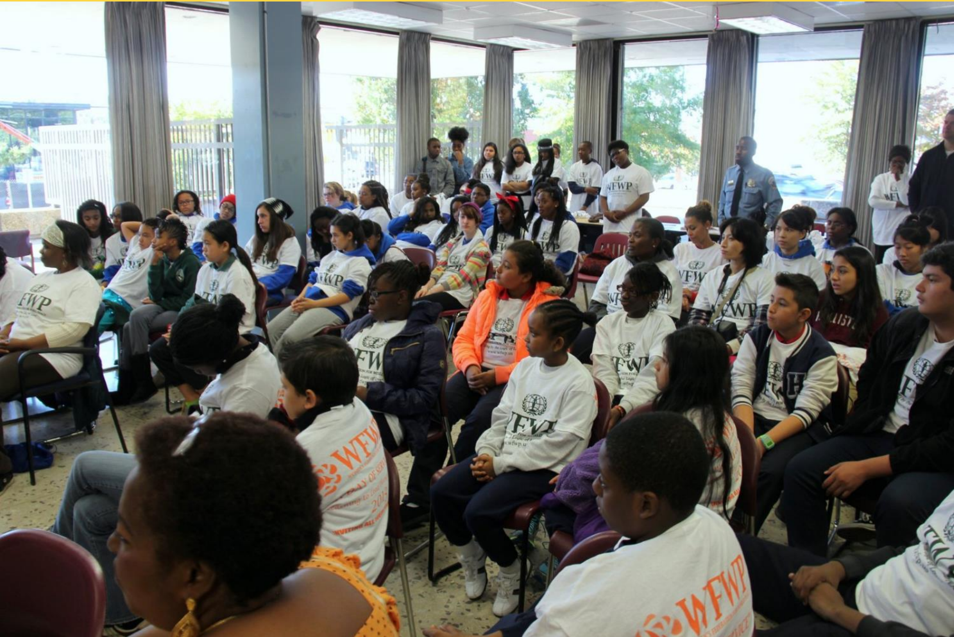
Everyone paid attention to all speakers.