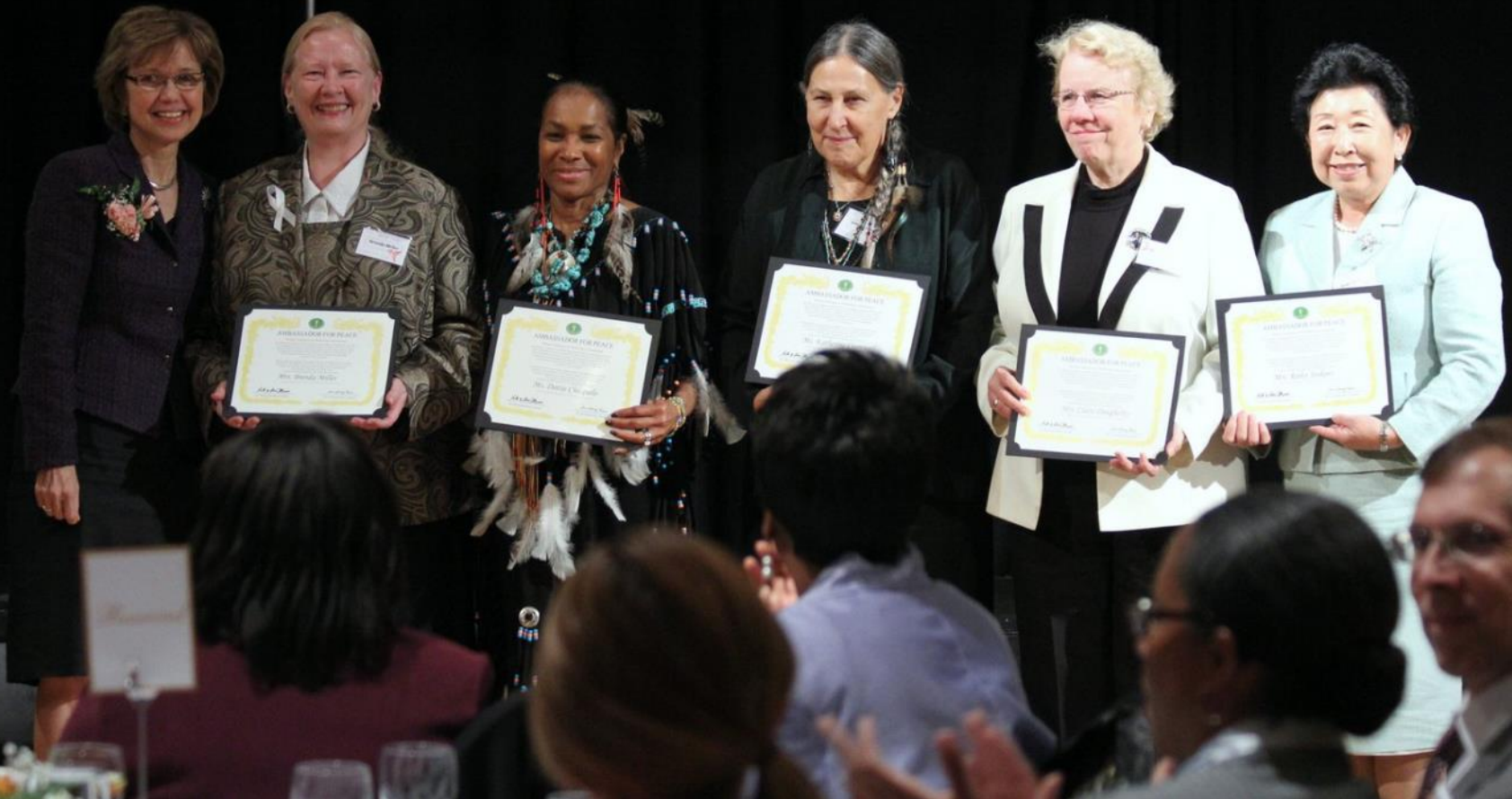
AFP appointment for the women who traveled the Trail of Tears and planted a new beginning for America.