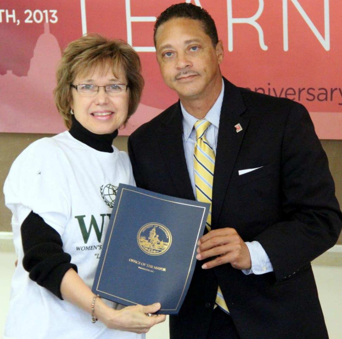
October 24 was declared a DAY OF SERVICE in Washington, DC, inspired by this event.