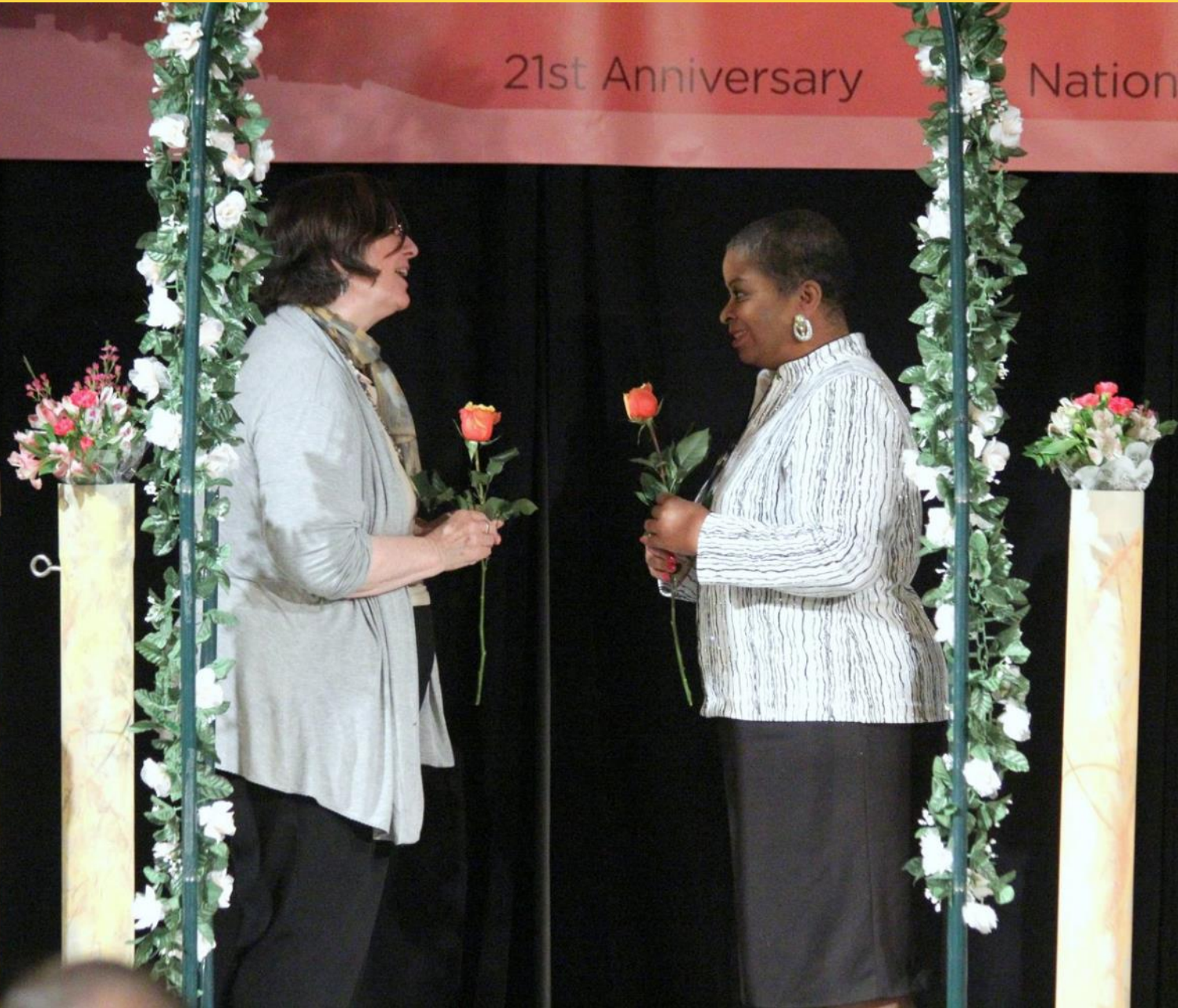
Crossing the aisle, crossing the Bridge - Reconciling Republicans and Democrats.