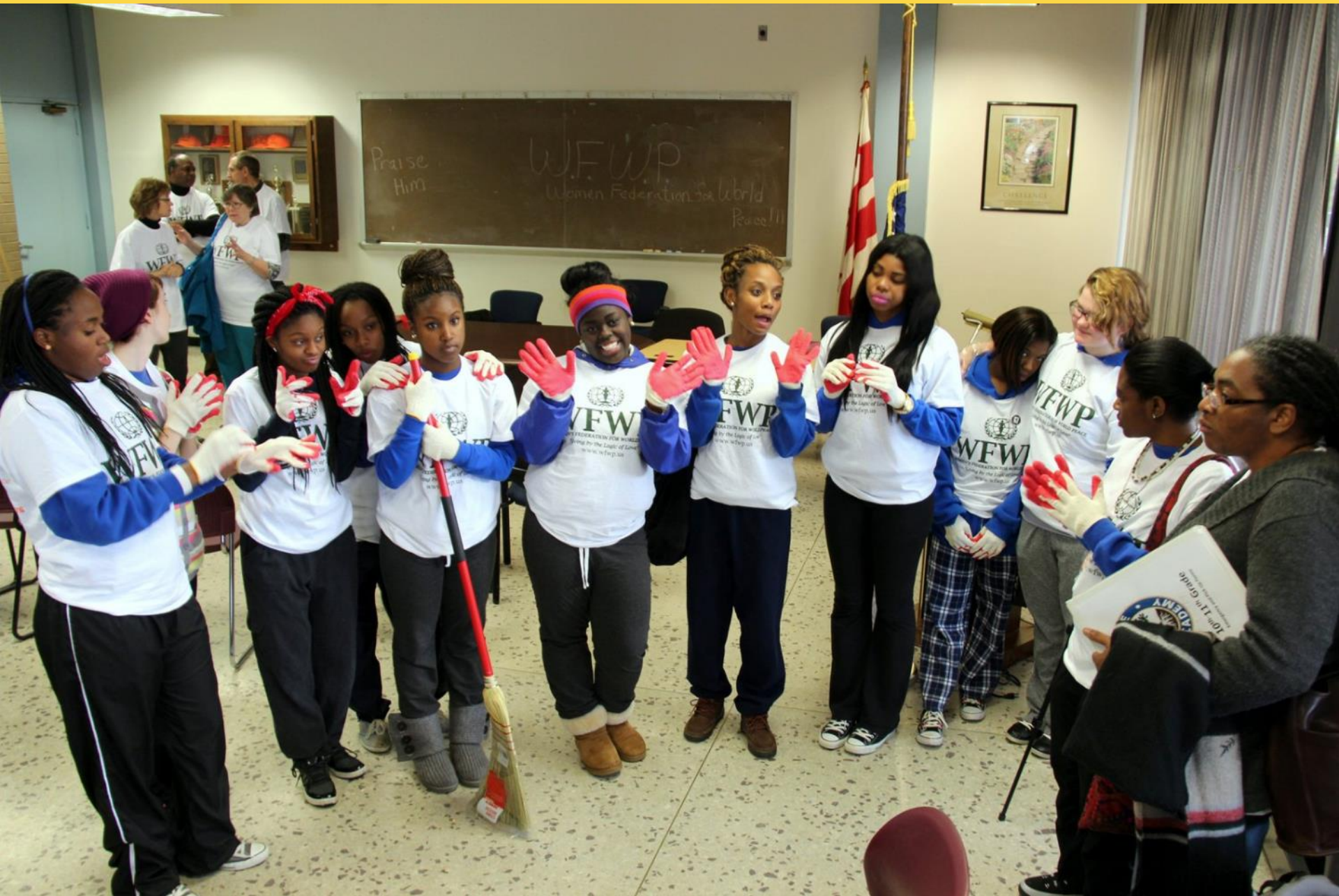
Inspired young girls getting ready for cleaning.