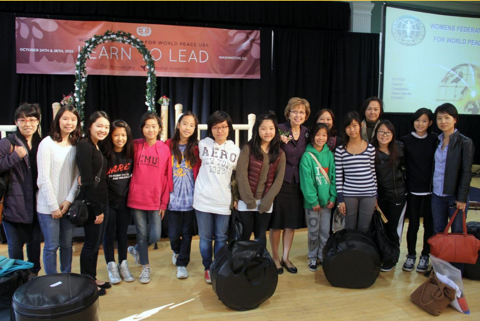
The "Heavenly Drummers" team won the Grand Prize at the Asian Festival in Korea.