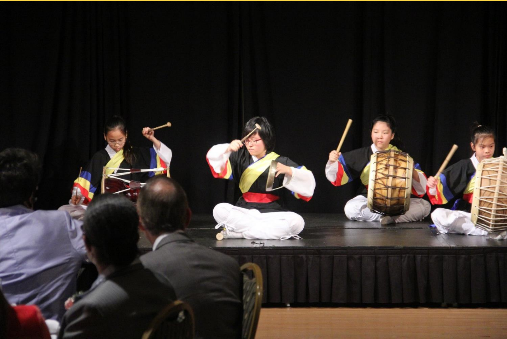
Focusing and meditating as they perform in unity.